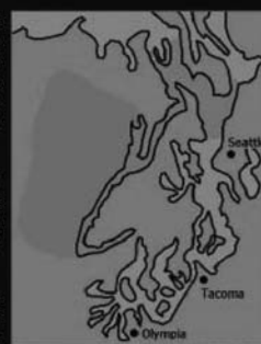
Map of estimated tree octopus maximum range, including spawning waters.