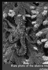
Rare photo of the elusive tree octopus

The reproductive cycle of the tree octopus is still linked to its roots in the waters of the Puget Sound from where it is thought to have originated. Every year, in Spring, tree octopuses leave their homes in the Olympic National Forest and migrate towards the shore and, eventually, their spawning grounds in Hood Canal. There, they congregate (the only real social time in their lives,) and find mates. After the male has deposited his sperm, he returns to the forests, leaving the female to find an aquatic lair in which to attach her strands of egg-clusters. The female will guard and care for her eggs until they hatch, refusing even to eat, and usually dying from her selflessness. The young will spend the first month or so floating through Hood Canal, Admiralty Inlet, and as far as North Puget Sound before eventually moving out of the water and beginning their adult lives.